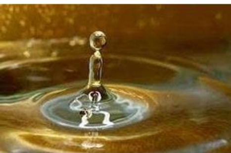
Diesel D2 & D6