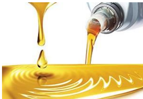
Jet – A1