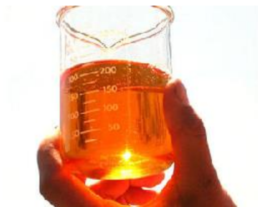
Basra Light Crude Oil