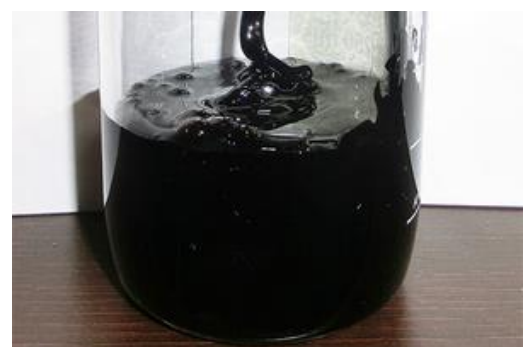
Fuel oil CST180, CST280, CST380